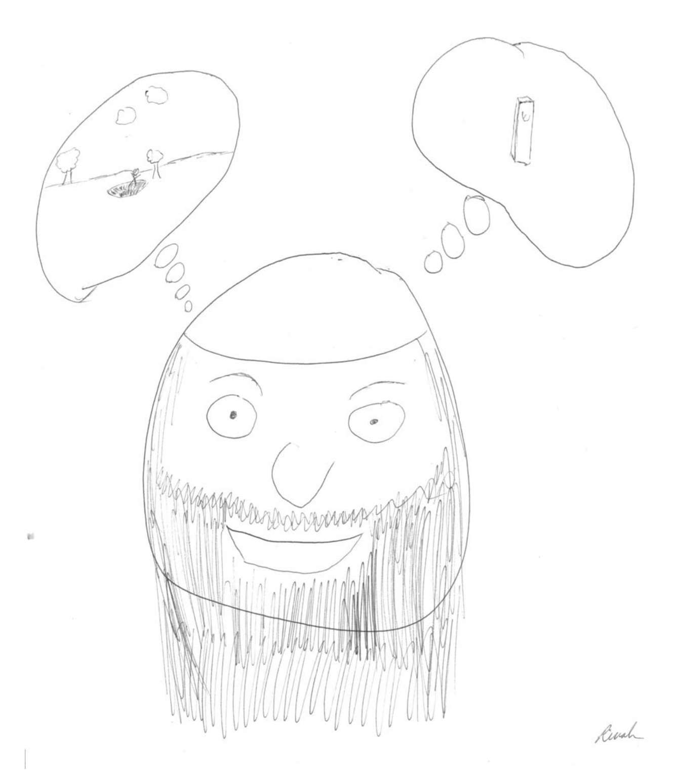
Moshe thinking about Torah